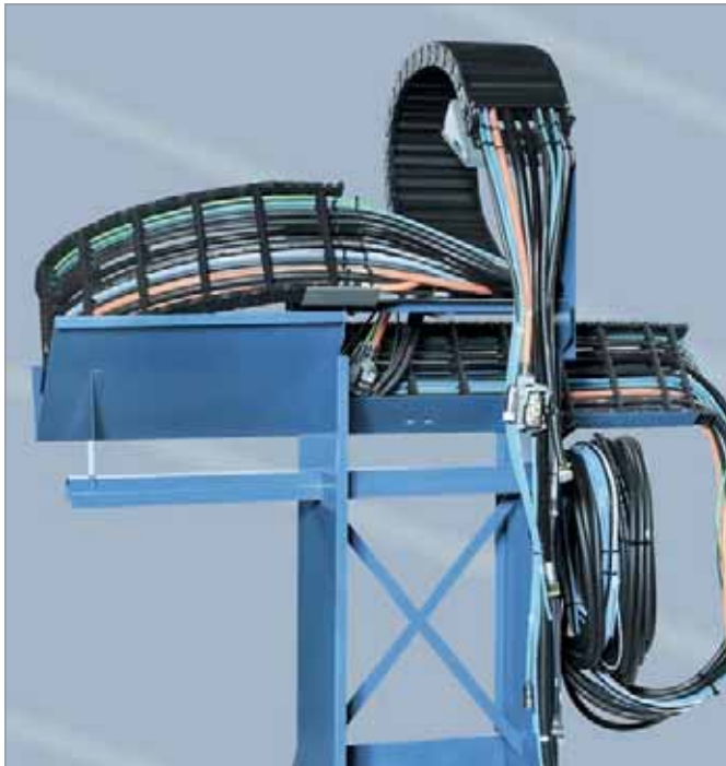
■ Complete systems on a transport frame