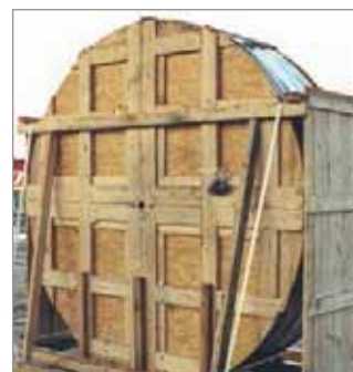
■ Fully harnessed cable carrier system in shipping crate