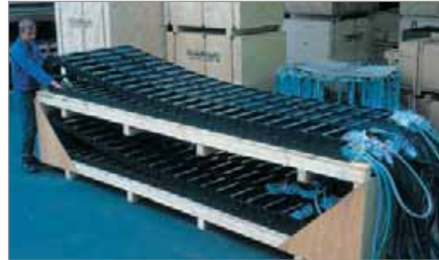
■ Ready-to-connect assembled carrier systems

We develop, design and supply all components required for your individual cable & hose carrier system.