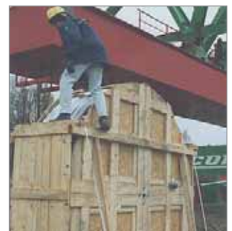
■ Assembly of the fully harnessed cable carrier system